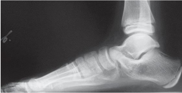
Fig. 1. Patient M., 12 years old. X-ray of the left foot in lateral projection: calcaneonavicular coalition; positive "anteater nose" symptom; the fusion site of the calcaneus and navicular bones is visualized

In 8 patients with fibrous forms of calcaneonavicular coalitions (including those with the "anteater nose" symptom), the fusion zone of the bones was not visualized. The frequency of the "anteater nose" symptom in the study groups is presented in Table 1.