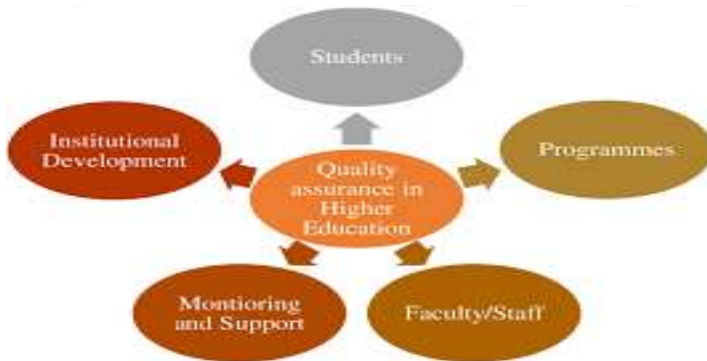
3-picture. Factor affecting the Quality assurance in Higher Education

Quality management is essential in education to ensure that students receive the best possible learning experience and outcomes. Quality assurance systems focus on monitoring, evaluating, and improving operations to provide consistency and improve results for learners. Quality management can help teachers by providing them with tools to assess student performance, identify areas of improvement and develop strategies for teaching.