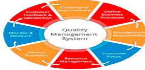
2-picture. Quality management system

This practical approach will help educators understand how to effectively use quality management in their work as well as provide strategies for implementing it within their own organizations. By having a better understanding of what quality means in education and how best to achieve it, educators can become more successful leaders in their fields.