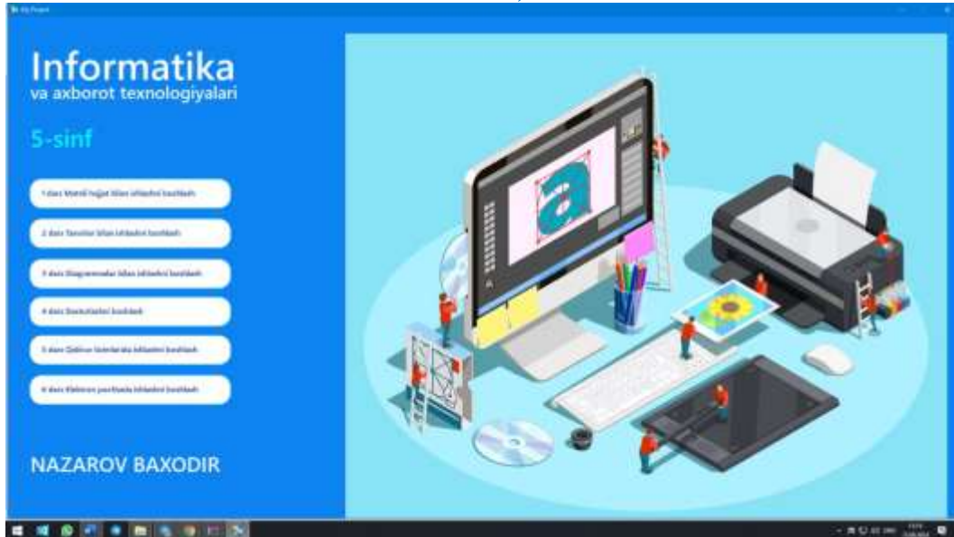
Figure 1. View of the software package

When we refer to one of the buttons "Start working with a text document", "Start working with images", "Start working with diagrams", "Start programming" and "Start working with search engines" in the cover window in the image above, relevant information on the topics written in this button will be displayed. 'data window will open.