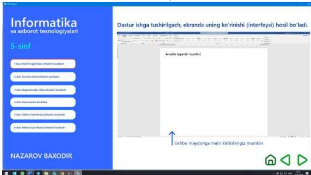
Figure 4. Microsoft Word program working window

When the switch button at the bottom of the above window is repeatedly pressed, information about the program's menus, text bolding, underlining text, formatting documents, choosing a test for evaluating students' knowledge on topics, solving the test, viewing the result windows are animated. are opened sequentially, this process can be viewed from the software tool.