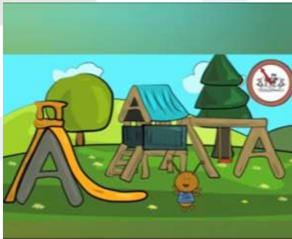
Figure 4. Aa letter finding game

Such questions can be used by students to learn how to write letters. Formation of students' writing skills. They will not only watch the video lesson on the topic "A sound and methods of teaching the letter Aa", but also learn the ability to analyze and comment on the video.