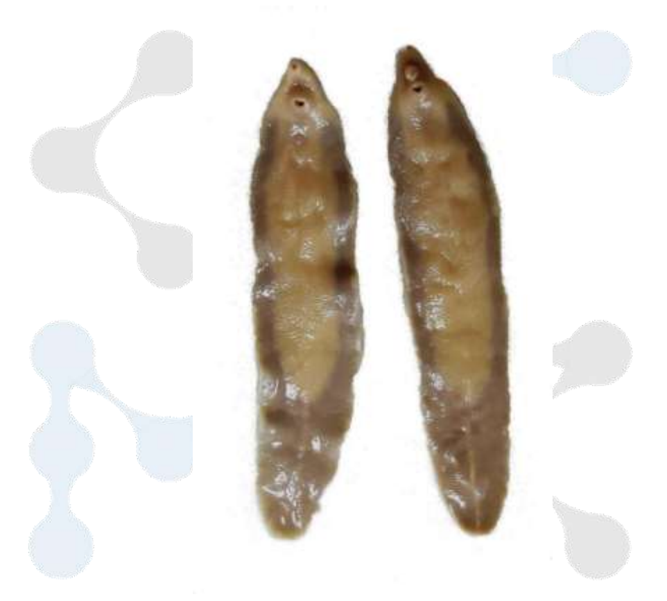
Figure 2. Fasciolagigantic (Cobbold, 1855) (original)

Conclusion . In the territory of the Republic of Karakalpakstan, the infection of donkeys with Fasciola gigantica trematode was studied . In the conditions of Karakalpakstan, it was found that the extent of infestation of donkeys with Fasciola gigantica trematode is 6.4% and the intensity of invasion is 3-19 copies.