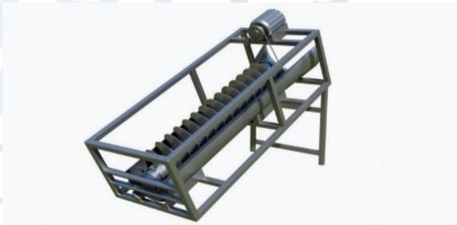
Figure 3. Archimedes screw turbine model

To prevent water from flowing between the blades, a container was placed, and the four sides of the screw turbine were reinforced with frames. A large pulley was installed on the top of the shaft, and a small pulley was installed on the generator shaft. Scythians were carved around, and a belt was attached to them. An image of an Archimedean screw turbine mounted horizontally at a deflection angle is shown in Fig. 3.