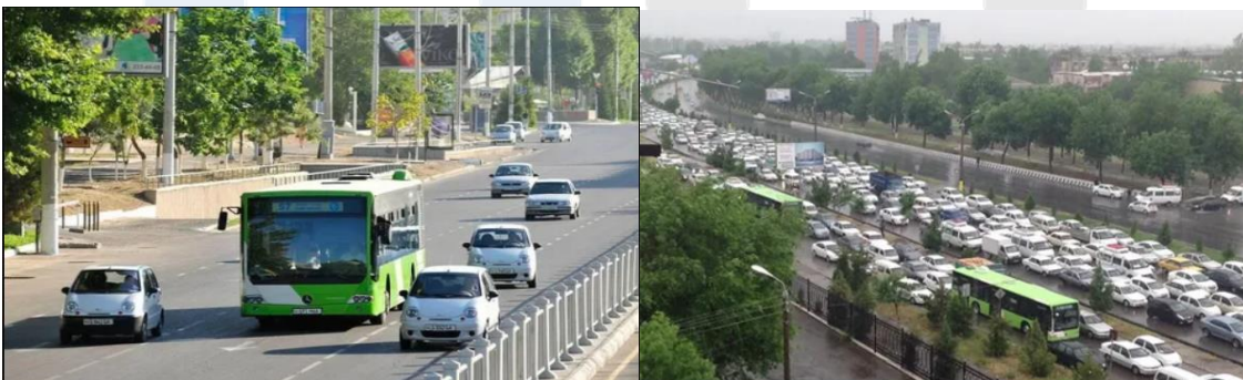
Figure 3. The content of movement of cars

a) public transport rolling stock in conditions of movement in separated areas; b) public transport movement in mixed traffic flow