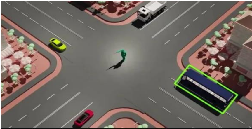
Figure 2. The allocation of a separate road lane for public transport

of public transport will decrease significantly, resulting in a significant decrease in the quality of transport services for all road users in high traffic conditions. [3]